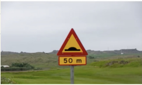
2 Bumps: a bumpy road.